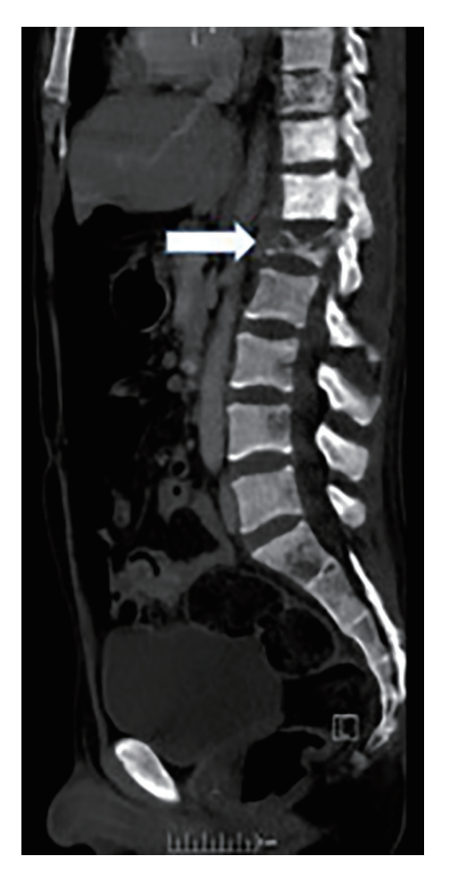
Figure 3. Image depicting mixed sclerotic as well as lytic lesions in the spine.

the spinal bodies from T10 to L1 (Fig. 3), the iliac crests, left sacrum, and the left ischial tuberosity and left supraclavicular lymphadenopathy (Fig. 4). The differential at that time inclined