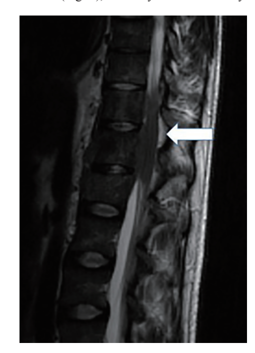
Figure 1. MRI spine depicting the lytic destruction of the spinal bodies and epidural mass at level T12-L1.

Magnetic resonance imaging (MRI) of the spine reported an epidural mass at T12-L1 level with spinal canal stenosis at T12 level (Fig. 1). Further workup included CT of chest/abdomen and pelvis which showed a large anterior mediastinal mass measuring 8.4 \times 5.9 cm (Fig. 2), mixed lytic/sclerotic bony lesions in