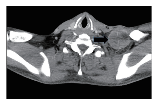
Figure 4. CT image depicting left supraclavicular lymphadenopathy/ mass.

towards germ cell tumor and lymphoma and decision was made to biopsy the left supraclavicular fossa lymph node.