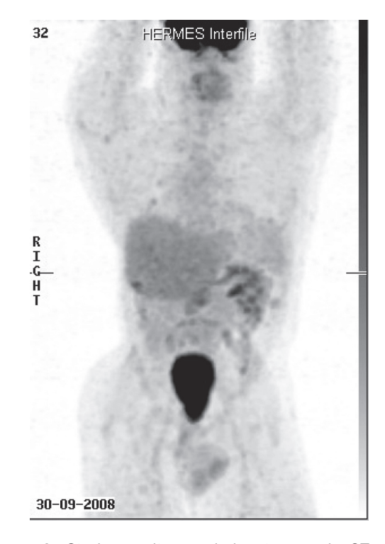
Figure 2. Staging positron emission tomography-CT scan showed uptake in the para-aortic region, the liver, a nodule inferior to the spleen, a nodule anterior to the proximal right latissimus dorsi muscle and variable uptake in the pulmonary nodules.

illary lymph node. He was assessed by a surgeon in April 2008. There was a plan for monitoring this with review again in August 2008 at which time it was still present. A submental node had also developed in the intervening time. He was booked for an excision biopsy but he presented to his local doctor with right upper quadrant discomfort in September 2008. CT scan showed a 39 x 71 mm retroperitoneal mass in the right para-aortic region in the field of his previous radiotherapy. It also showed multiple liver lesions, pulmonary nodules, and lymphadenopathy. He was then referred to Can-