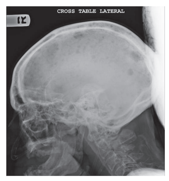
Figure 2. X ray of the skull showing multiple osteolytic lesions in the skull.

minute. General examination revealed cachectic old male with mild respiratory distress. Physical examination revealed bilateral cervical, axillary and inguinal hard, non matted lymphadenopathy; tachycardia and tachypnea. Physical examination was unremarkable otherwise including sensory and motor examinations. Laboratory investigations revealed leucocytosis with WBC count of 21,000/µL, normocytic normochromic anemia with hemoglobin of 7.6 g/dl. Blood chemistry showed sodium of 121 mmol/l, potassium 6.2 mmol/l, bicarbonate 5 mmol/l, BUN 95 mg/dl, serum creatinine 4.8 mg/dl, albumin of 1.8 g/dl, total protein of 8 g/ dl, alkaline phosphates of 154 IU/l and corrected anion gap of 19.5. Blood gas analysis revealed mixed anion and non anion gap metabolic acidosis. Urine toxicology was negative including for alcohol. Urine analysis revealed proteinuria