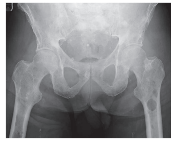
Figure 1. X ray of the pelvis showing multiple osteolytic lesions in the left femur.

minute. General examination revealed cachectic old male with mild respiratory distress. Physical examination revealed bilateral cervical, axillary and inguinal hard, non matted lymphadenopathy; tachycardia and tachypnea. Physical examination was unremarkable otherwise including sensory and motor examinations. Laboratory investigations revealed leucocytosis with WBC count of 21,000/µL, normocytic normochromic anemia with hemoglobin of 7.6 g/dl. Blood chemistry showed sodium of 121 mmol/l, potassium 6.2 mmol/l, bicarbonate 5 mmol/l, BUN 95 mg/dl, serum creatinine 4.8 mg/dl, albumin of 1.8 g/dl, total protein of 8 g/ dl, alkaline phosphates of 154 IU/l and corrected anion gap of 19.5. Blood gas analysis revealed mixed anion and non anion gap metabolic acidosis. Urine toxicology was negative including for alcohol. Urine analysis revealed proteinuria