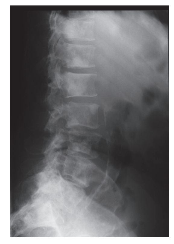
Figure 3. X ray of the thoraco-lumbar vertebrae showing osteoblastic lesions.