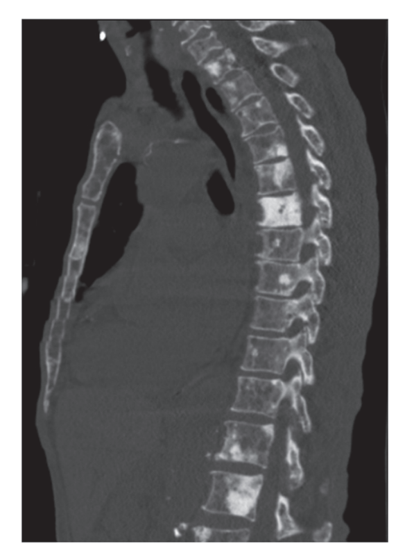
Figure 4. Reconstruction images of the CT chest showing multiple osteoblastic lesions in thoraco-lumbar vertebrae.