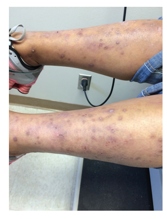
Figure 2. Excoriations and lesions on legs before treatment

What was originally thought to be a drug-induced reaction was confirmed by lymph node biopsy to be LCH. This