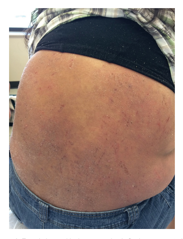
Figure 1. Excoriation and lesions on patient's flank on presentation.

performed to exclude Hodgkin's lymphoma and demonstrate the atypical CD30 positive cells to be positive with Langerhan cell antigen (CD45) and focally positive with CD20.