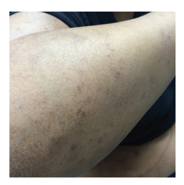
Figure 5. Lesions after therapy.

show these cells are positive for S-100, Fc receptor, CD1 [4, 5]. Our patient was found to have stains positive for S100, CD1a and CD30. The etiology of LCH remains unknown; research has shown links between Epstein-Barr virus, malaria and leukemia [5].