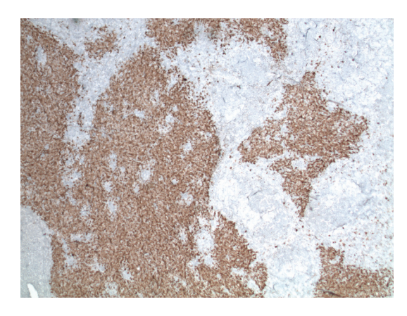
Figure 4. Immunohistochemical stain with S-100, magnification × 2. The Langerhans cells are S-100 positive.

LCH is most commonly seen in northeastern European male children and presents as bone lesions. Several retrospective studies have shown that 51-71% of children with LCH present with multiorgan disease; immunohistochemical stains